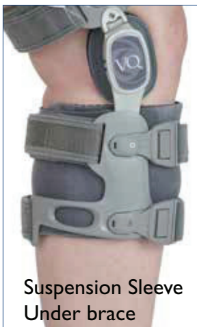
Suspension Sleeve Under brace