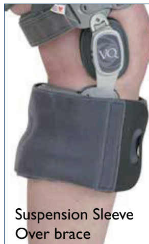
Suspension Sleeve Over brace